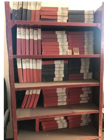
Records in office almirahs