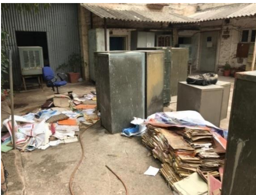
Weeding of files

Old records were scanned and kept in digital form. The unused files were weeded out. Rest of the records are maintained in office almirahs.