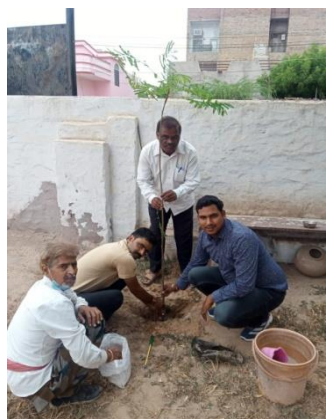
At Bikaner Office