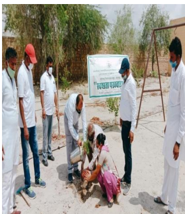
At Mohangarh Group of Mines

As a part of Swachhta Pakhwada 2021, At Jodhpur Head Office and All Area Offices of FAGMIL was assigned the all-important responsibility of Tree PLANTATION OF Tree/Saplings or beautification through plantation on 9 th September, 2021. Further the programme, road-map was also structured including identifying the area where planting of saplings to be done and also species of saplings to be selected depending upon the present weather and soil conditions. On 9 th September all the employees of FAGMIL gathered in the planting area by 11.30 AM alongwith other staff members for "Plantation of saplings".