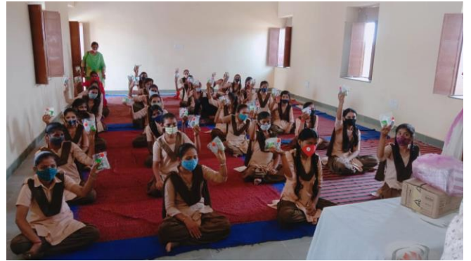
At Mohangarh Group of Mines