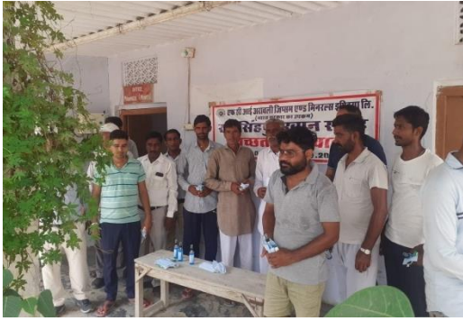
At Ramsinghpur Group of Mines