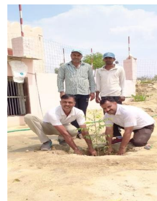
At Suratgarh group of mines

Places were identified at our new Head office at Jodhpur for beautification of Office through plantation. Glimpses of Plantation at Jodhpur Head Office: