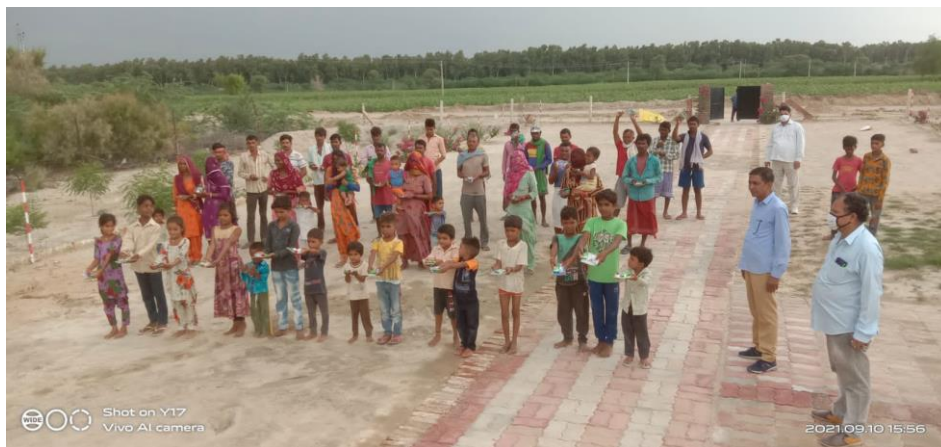
At Suratgarh Group of Mines

Posters were displayed to convey the message of cleanliness